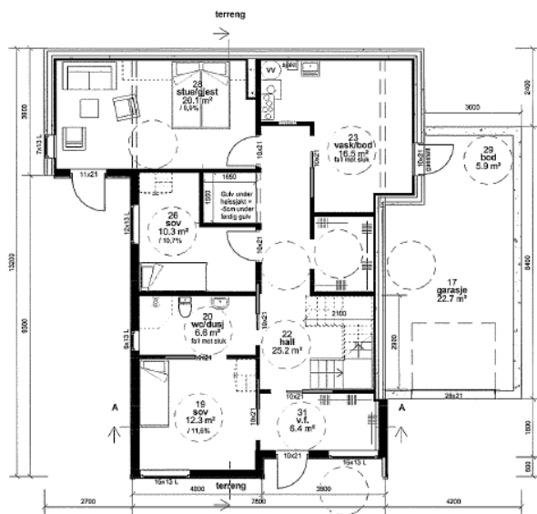
1.0 Underetasje 1 : 100