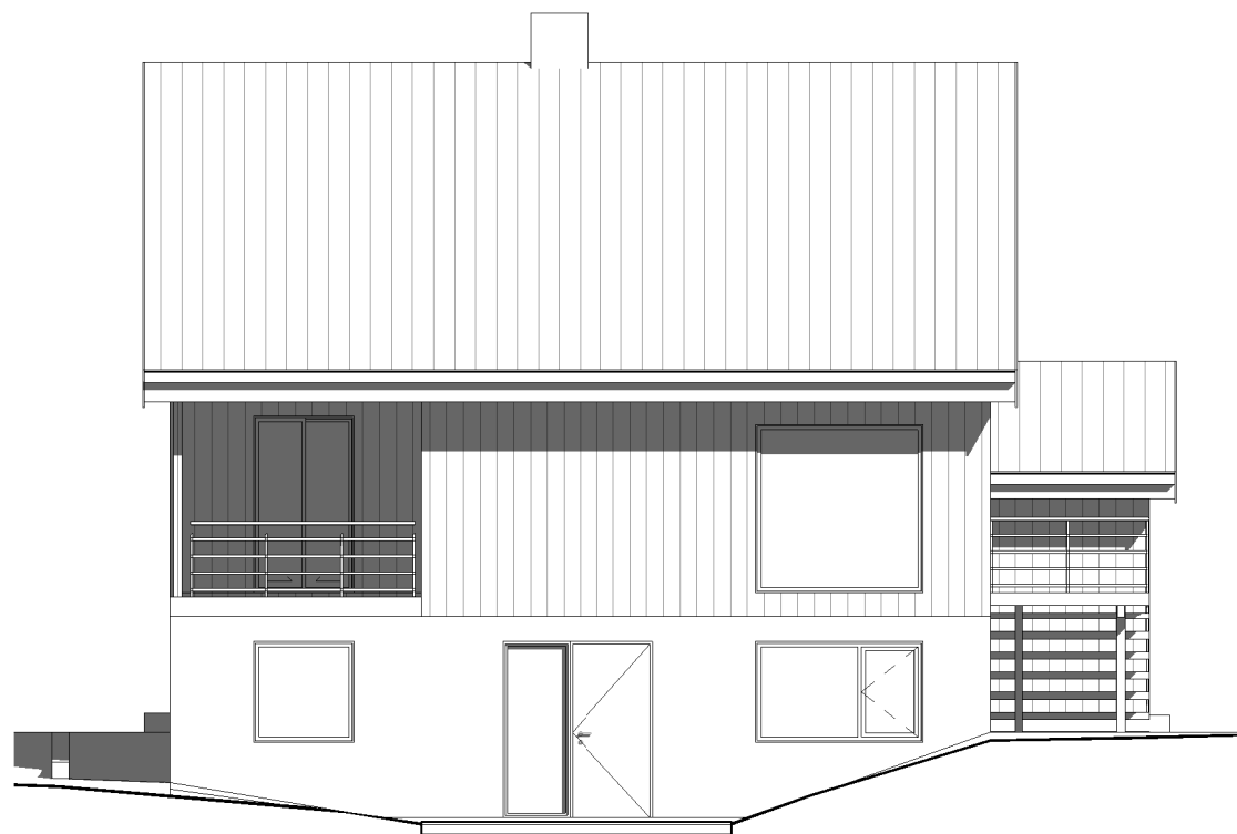
② Vest 1 : 50